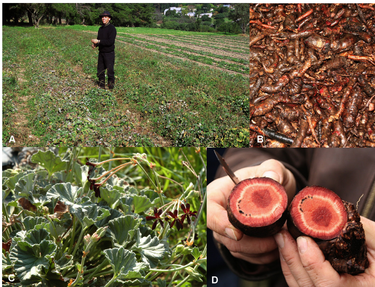
Fig. 2. Pelargonium sidoides . (A) commercial plantation; (B) harvested raw material; (C) flowering plant with leaves and flowers; (D) the tuberous root in cross section. Photographers: Van Wyk (A, B, D), A. Oskolski (C).

All of these trials reported efficacy, with limited or no side effects.